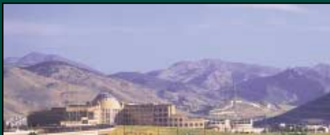
Outstanding Mountain Views