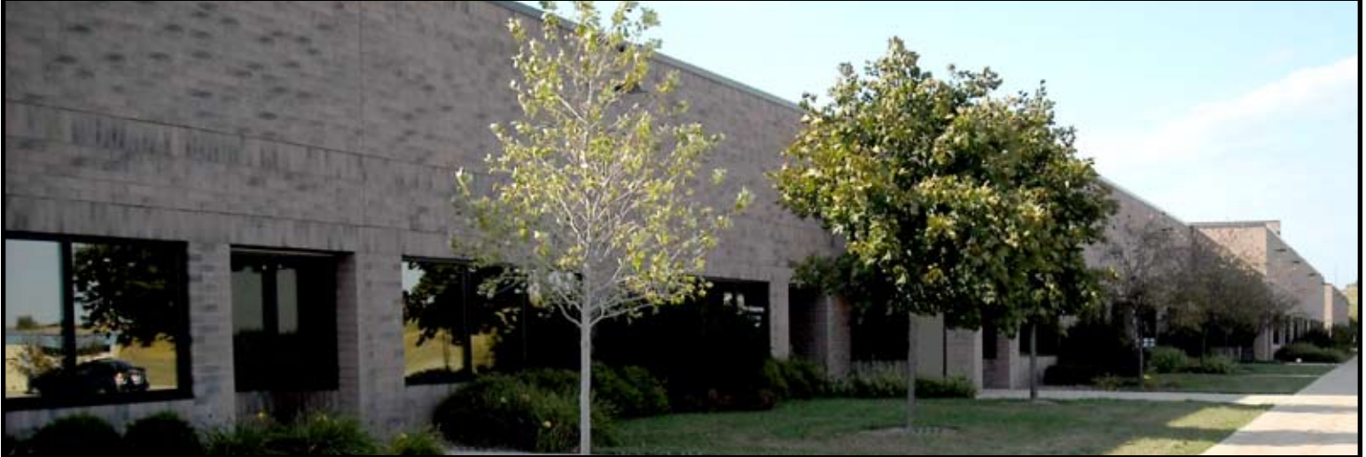
201-202 Moravian Valley Road, Waunakee, WI 53597