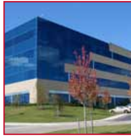
On Office deals at MD Science and Technology Center Bowie, MD

*This replaces all prior promotions. St. John Properties reserves the right to cancel these promotions at any time.