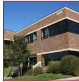
On Office and Flex deals at 11155 Dolfield Blvd. Dolfield Business Park Business Center at Owings Mills Owings Mills, MD