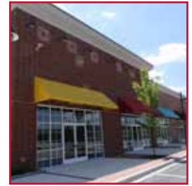
On Office, Flex and Retail deals at Baltimore Crossroads @95 White Marsh, MD