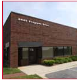
On Office and Flex deals at Riverside Technology Park Frederick, MD