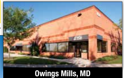
Owings Mills, MD