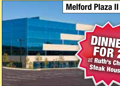
Melford Plaza II

Melford Plaza II (16901 Melford Boulevard) at Maryland Science & Technology Center @ Melford