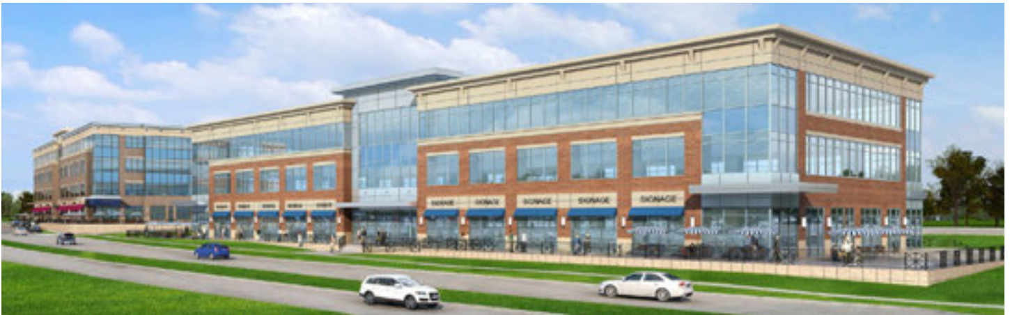
6201 Greenleigh Avenue