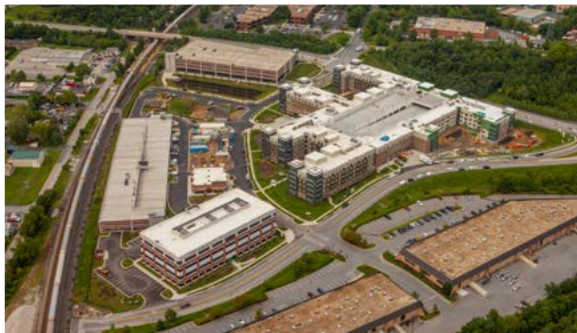
Below: Aerial photography (8/2017) of construction progress; artist rendering of The Residences, luxury apartments

The retail component will function as an amenity to Annapolis Junction Town Center and the adjacent business and office parks, and commuters to the Savage/Ft. Meade area. Approximately 100,000 employees work in the surrounding area.