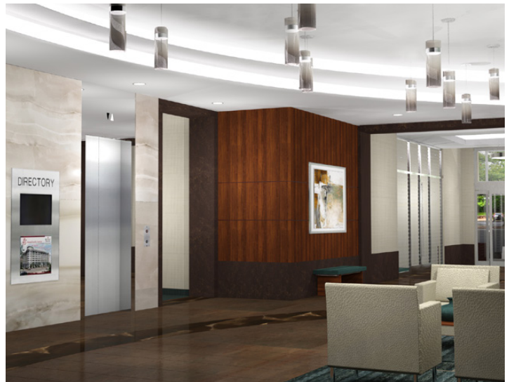
Above: Interior lobby renderings of 810 Bestgate Road