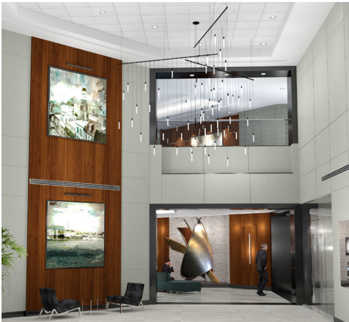
ABOVE: Interior lobby rendering