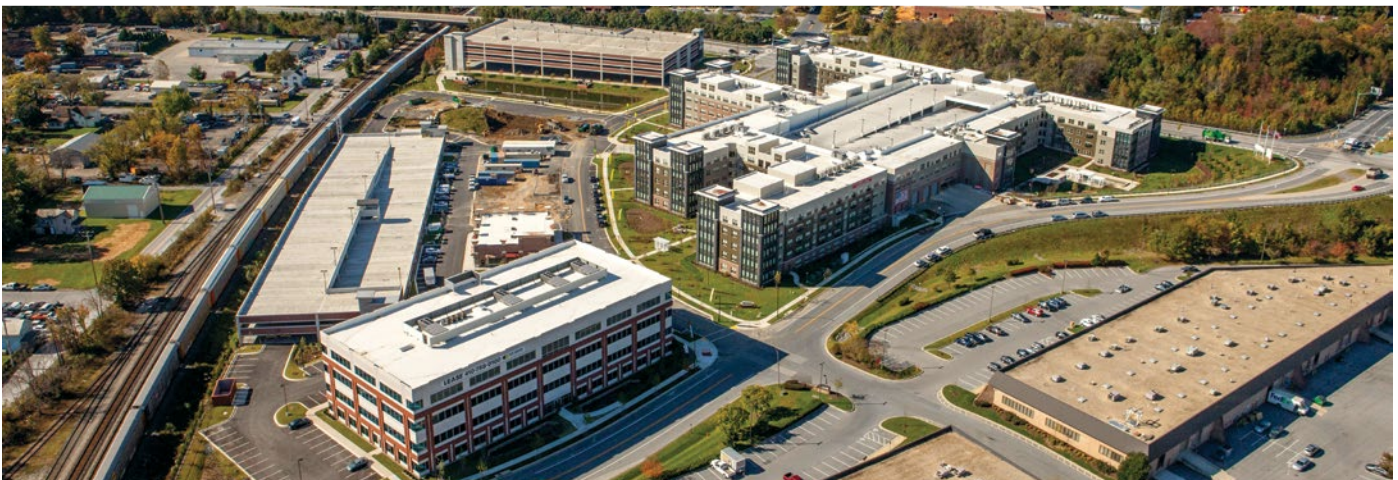
Clockwise from bottom left: The Residences, luxury apartments; 10170 Junction Drive—multi-story class 'A' office; aerial photography (10/2017) of construction progress