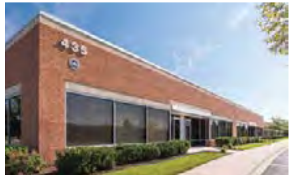
Single-story class 'A' office exterior