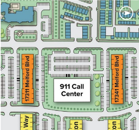
SOUTH EAST MELFORD