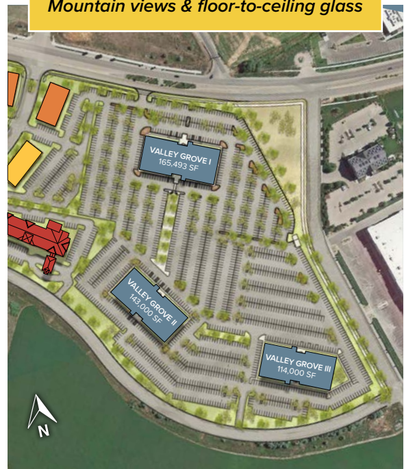
Mountain views & floor-to-ceiling glass