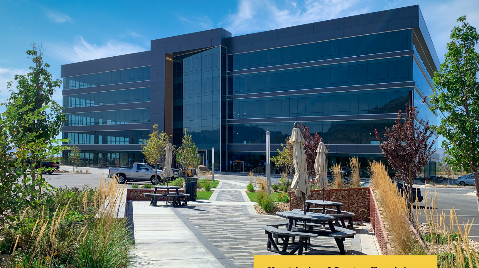
Mountain views & floor-to-ceiling windows