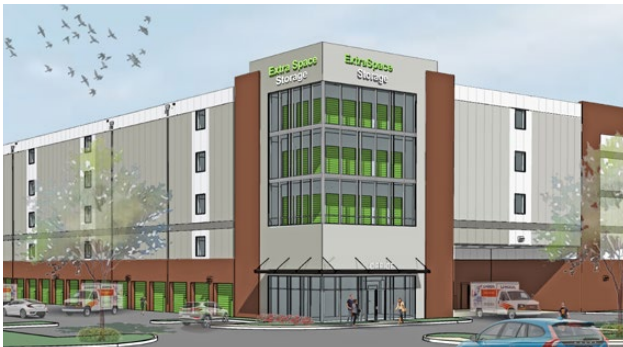
981 Waugh Chapel Way, self-storage rendering