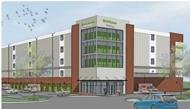
981 Waugh Chapel Way, self-storage rendering